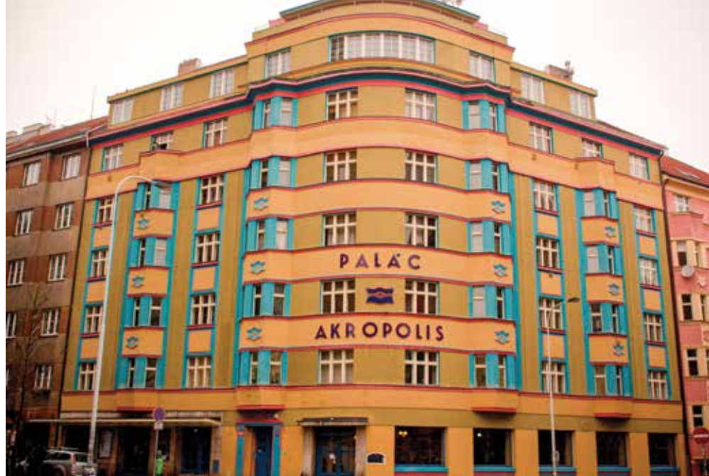
Palác Akropolis is a palace of entertainment with a café, restaurant, smaller bar upstairs, a theater, and a club with two stages downstairs.

Žižkov has a couple of good theaters (including one dedicated solely to the adventures of fictional polymath Jára Cimrman) as well as an excellent indie cinema and arts center.