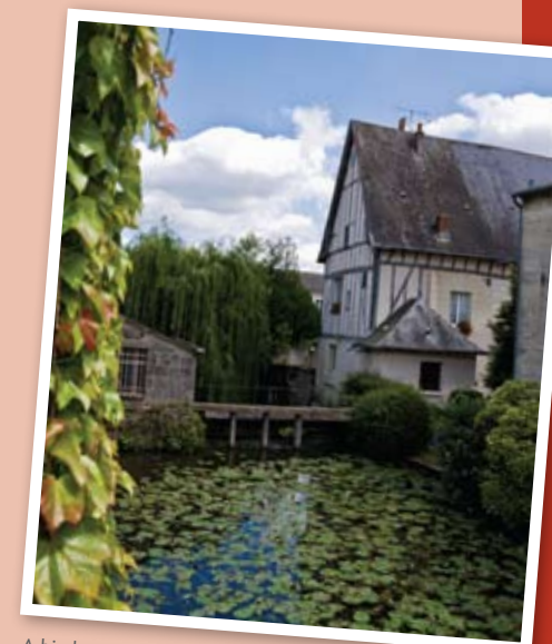
A big house with a big pond in lovely Langeais