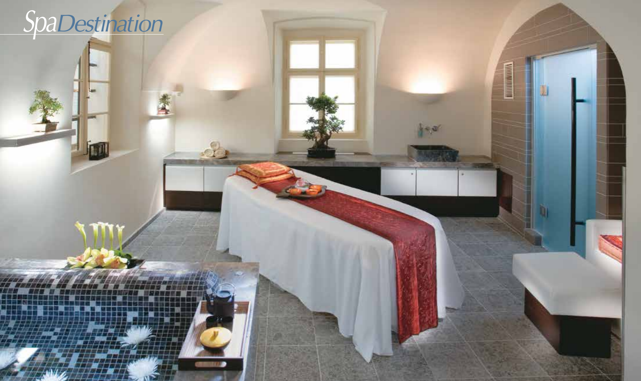
THIS PAGE: The Spa at Mandarin Oriental, Prague offers a serene escape. OPPOSITE PAGE: The Spa at Mandarin Oriental, Prague is set inside a former 14th-century chapel; Ecosotica Spa at the Alchemist Grand Hotel

treatments – all with an Asian accent – is superb. The lavish Jasmine Anti-Oxidant Massage combines aromatherapy and Swedish strokes, using jasmine and pomegranate massage oil, which minimises signs of ageing and relieves emotional tension, while the Healing Thai Herbal Compress Treatment includes a warm body compress of premium Eastern herbs to dissolve all of the muscle tension from your body and soothe the mind, followed by a chakra-realigning massage. Other ever-popular treatment options include the Path Less Ordinary Herbal Foot Treatment, which boosts circulation, cleansing dead skin and warding off odour-causing microbes; the Inner Peace Massage, a back and head treatment combining Swedish and Shiatsu techniques to relieve ailments such as high blood pressure; and the Skin Nourisher Treatment, a full body scrub and red algae body wrap (encouraging cell renewal, drawing out harmful skin pollutants) followed by a head massage.