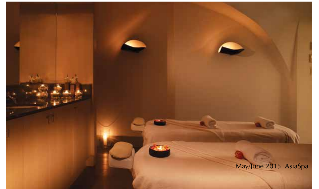
THIS PAGE: The cosy, welcoming changing rooms at the Spa at Four Seasons Hotel Prague; the Augustine Spa at The Augustine Prague. OPPOSITE PAGE: The Augustine Prague was once a 13th-century monastery and brewery. OPENING PAGE: Romantic and vibrant at the same time, Prague is a city of contradictions

For those who like to earn their relaxation, there's also the opportunity to work up a sweat in the gym, fitted throughout with professional Technofit equipment. Take full advantage of the free juice, Gatorade and water in the fridge – and don't miss the joy of wrapping a cold towel around your overheated neck.