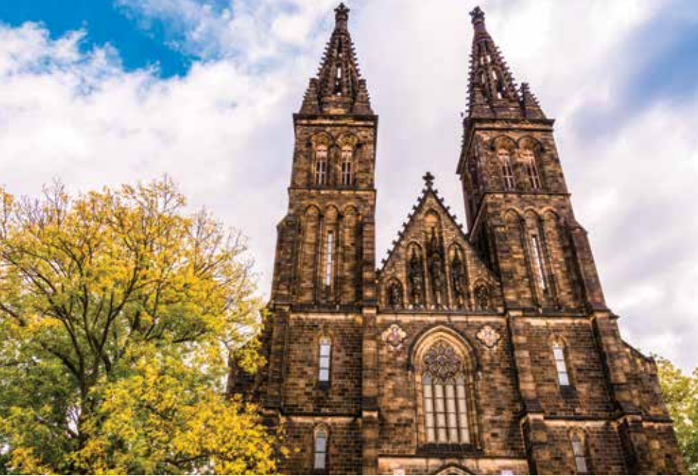
Many of Prague's greats lie buried in the cemetery adjacent to the Basilica of Sts. Peter and Paul. Most notable are the graves of Antonín Dvořák, Bedřich Smetana, and Alfons Mucha.

National Revivalists of the 19th century, particularly writer Alois Jirásek. Jirásek mined medieval chronicles for legends and facts to glorify the early Czechs, and that era of Czech history is very much in the popular consciousness today.