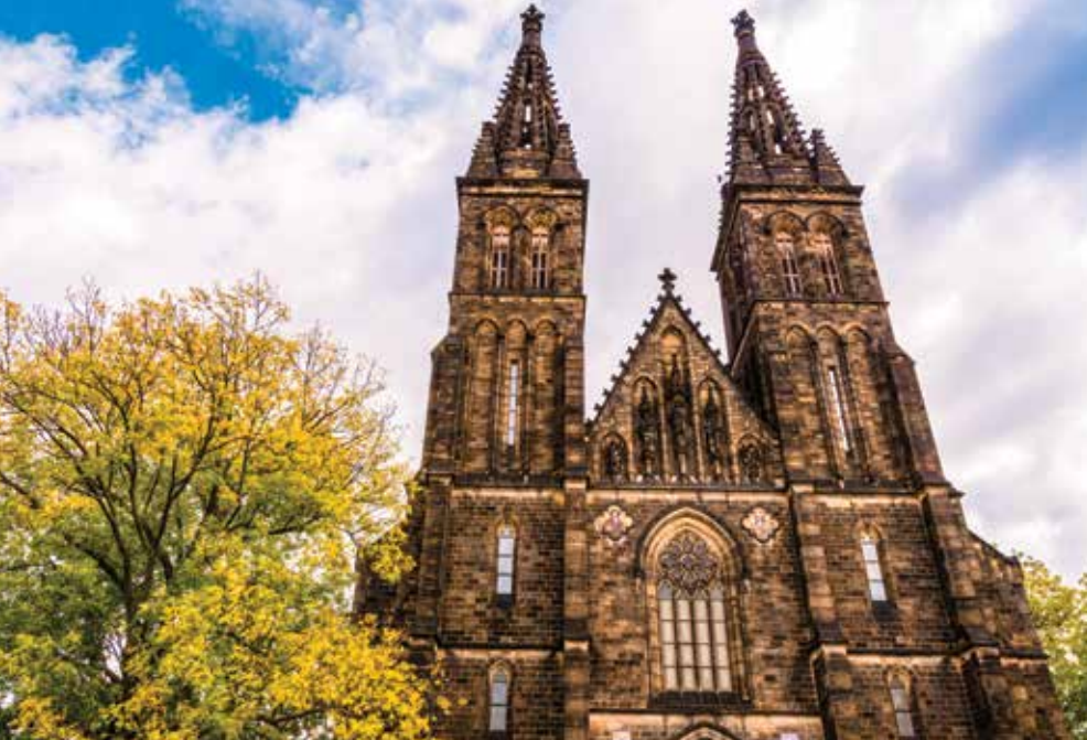
Many of Prague's greats lie buried in the cemetery adjacent to the Basilica of Sts. Peter and Paul. Most notable are the graves of Antonín Dvořák, Bedřich Smetana, and Alfons Mucha.

National Revivalists of the 19th century, particularly writer Alois Jirásek. Jirásek mined medieval chronicles for legends and facts to glorify the early Czechs, and that era of Czech history is very much in the popular consciousness today.