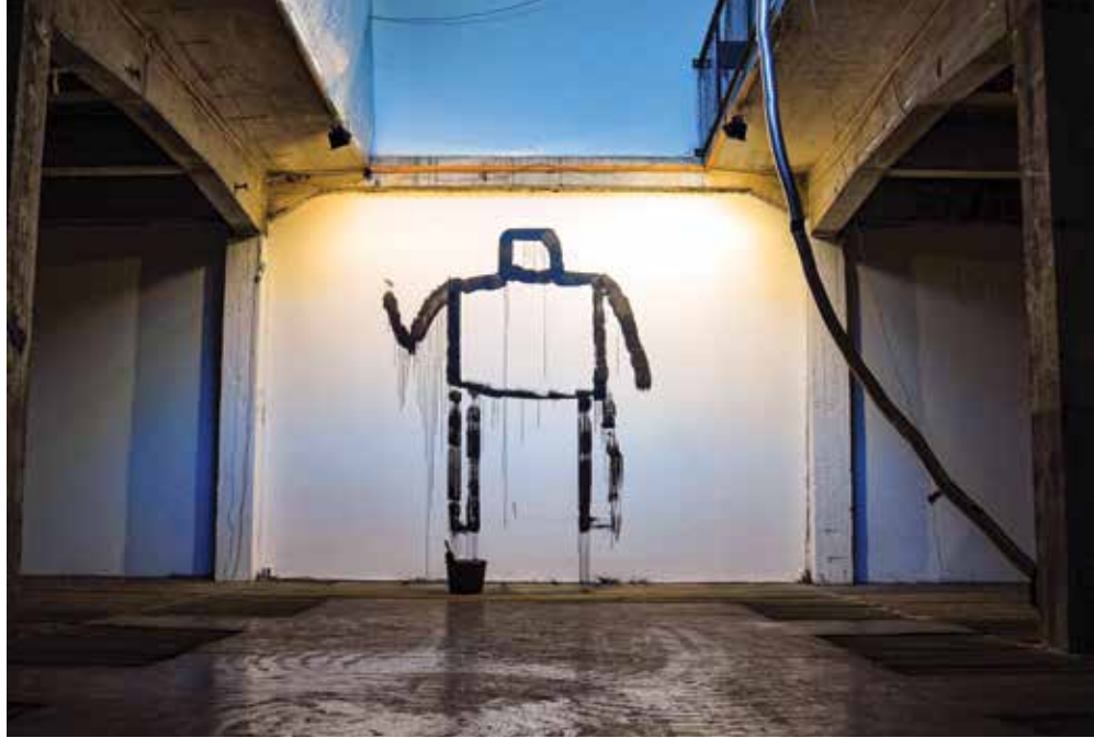
Housed in former military barracks, Karlín Studios is a unique complex of art studios and galleries showcasing contemporary Czech art.

Once a blighted testament to the fates of state-controlled industry, Karlín is now on the up and up. Nowhere is that more apparent than in its ever-increasing choice of fashionable eating options.