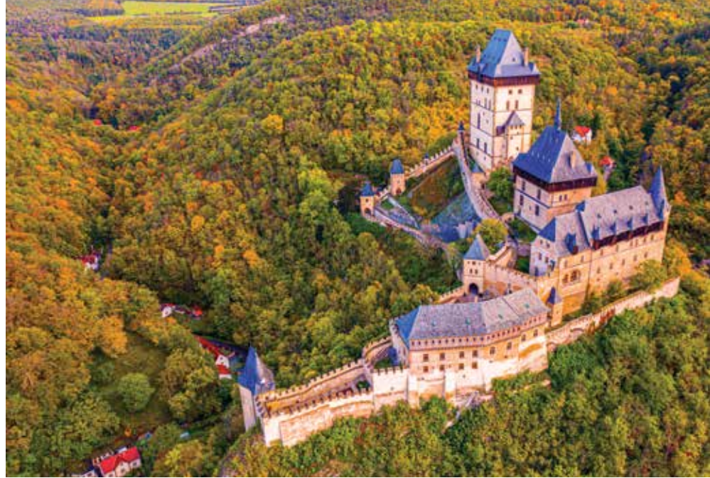
Karlštejn Castle is a 45-minute train ride from Prague, and one of the most convenient and popular escapes from the Czech capital city.

Pod dračí skálou $$ | CZECH | This traditional hunting lodge-style restaurant is the most rustic and fun of Karlštejn's eateries. To find it, follow the main road uphill out of the village about a third of a mile from town. Known for: large portions of good food; hit-or-miss service; accommodation