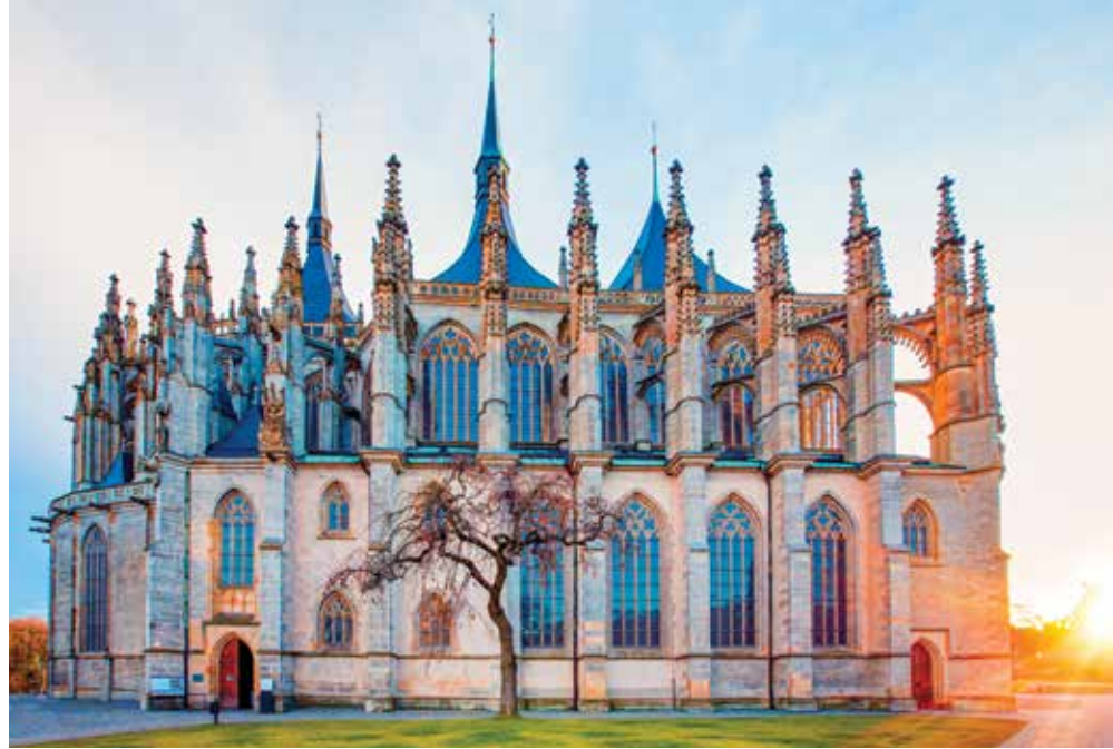
The looming St. Barbara’s Cathedral is a tribute to Kutná Hora’s miners.

✉ Barborská 28, Kutná Hora ☎ 327–512–159 🌐 www.cms-kh.cz 🚗 From 70