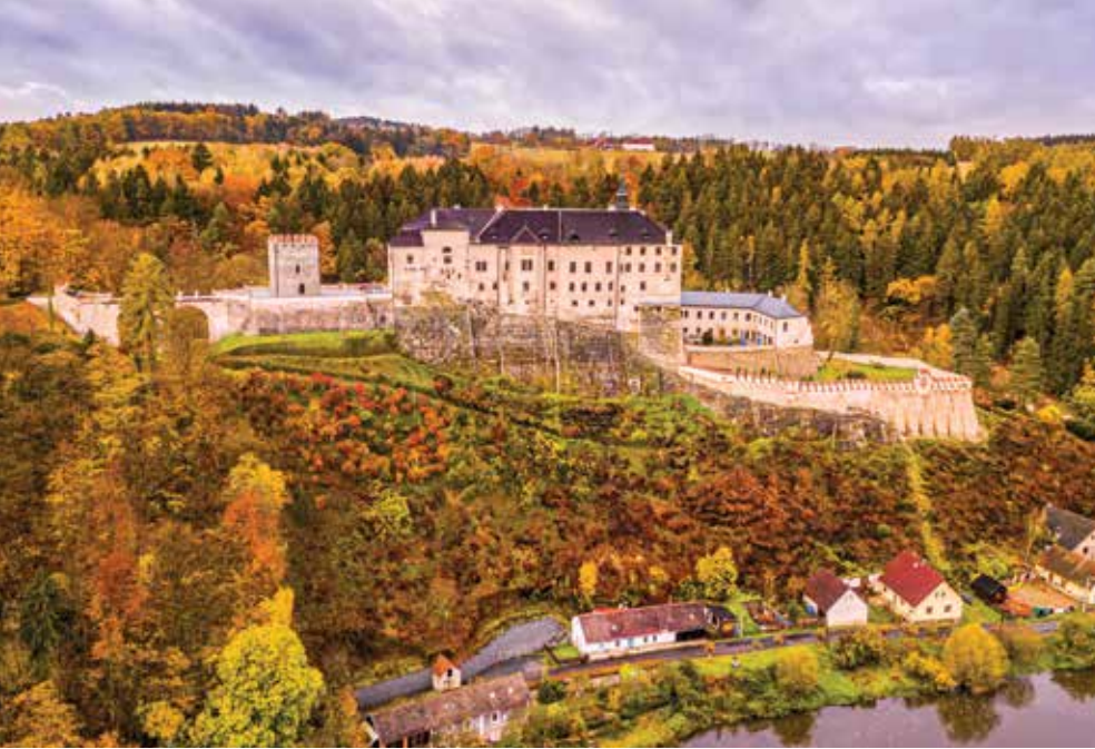
Český Šternberg, or the “Star on the Hill,” lives up to its name.

Šternberg may not be the easiest day trip from Prague, but for history, atmosphere, and authenticity, it’s hard to beat.