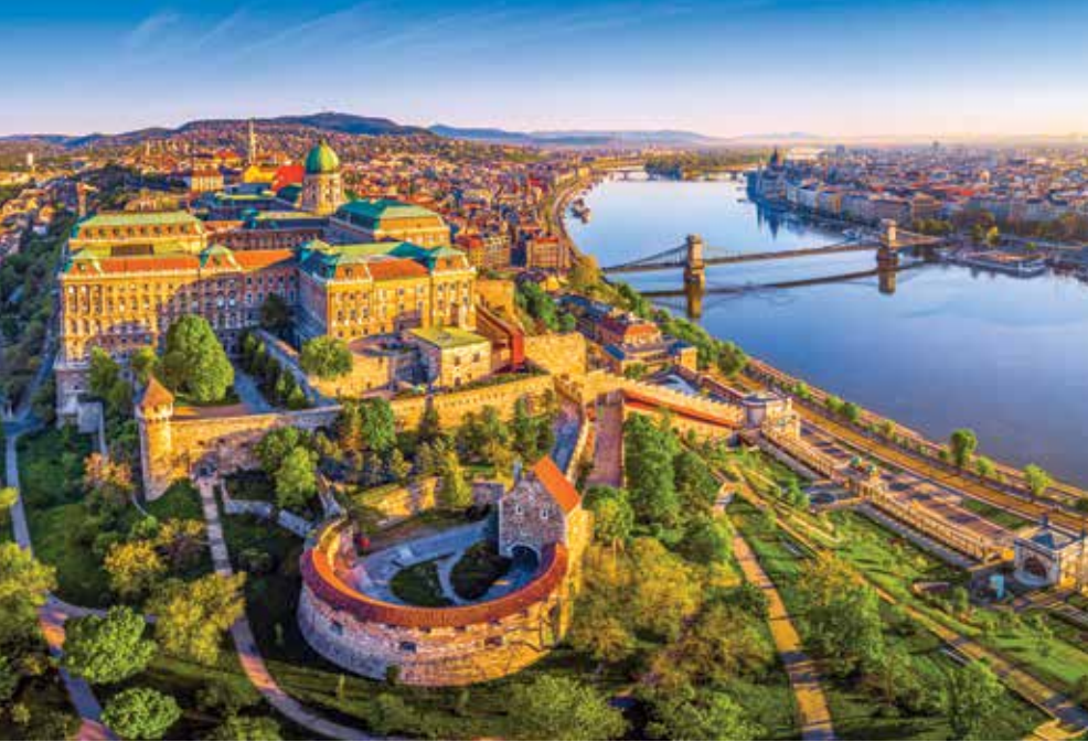
Királyi Palota or the Royal Palace is a historic castle-and-palace complex atop Castle hill on the Buda side, hence it is also referred to as Buda Castle.

west wing (F) is home to the Országos Széchényi Könyvtár (National Széchényi Library), which has a copy of more than two million volumes—everything ever published in the Hungarian language—along with well-preserved medieval codices, manuscripts, and even a sound library. ☒ Szent György tér 2, Castle District 🌐 budavar.hu 📧 Grounds free. Exhibition prices vary; see individual listings 🚶 M2: Déli pályaudvar.