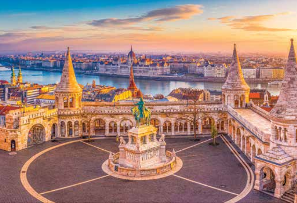
The Halászbástya or Fisherman's Bastion with its panoramic viewing terrace and fairy-tale towers is one of the best known monuments in Budapest.

house at number eight, with its pink-and-white striped facade and unusual curved windows. Nearby is the medieval stone gateway (rebuilt in 1936) that marks the northern entrance to Castle Hill, and after which the square is named. Literally translated as “Vienna Gate,” the archway once sat at the end of a highway that connected Buda Castle to the Austrian capital. ☒ Castle District 📍 M2: Széll Kálmán tér.