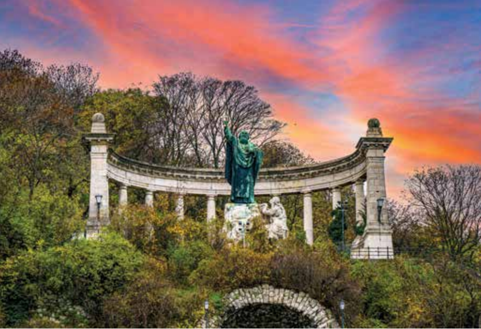
Szent Gellért-szobor is a grand monument to Hungary's first missionary who met a less-than-grand end when thrown off the hill here.

as authentic as it could be. ☒ District I, Sziklatemplom út, Tabán ☎ 20/775-2472 🌐 www.sziklatemplom.hu 🆓 Free ☺ Closed Sun. (except for mass) 📄 M4: Szent Gellért tér.