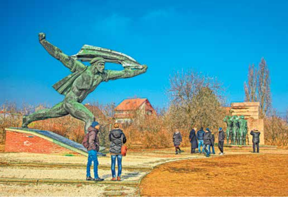
Memento Park offers a glimpse behind the Iron Curtain to the symbolic life of Cold War Hungary.

place for a vegan—but this gem is one of the places helping to change all that. A perfect, quick refueling restaurant with such good vegan and veggie burgers, hot dogs, and salads that even committed carnivores are tempted. Known for: a delicious broccoli burger (we aren't kidding); environmentally conscious; perfect for the vegan-curious. 📍 Average main: Ft2,800 📍 Bartók Béla út 9, Gellérthegy www.veganlove.hu 📄 M4: Szent Gellért tér.